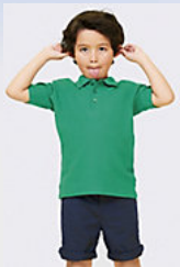
SOL'S SUMMER II KIDS 11344