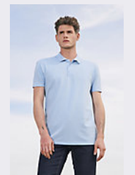
SOL'S SUMMER II 11342